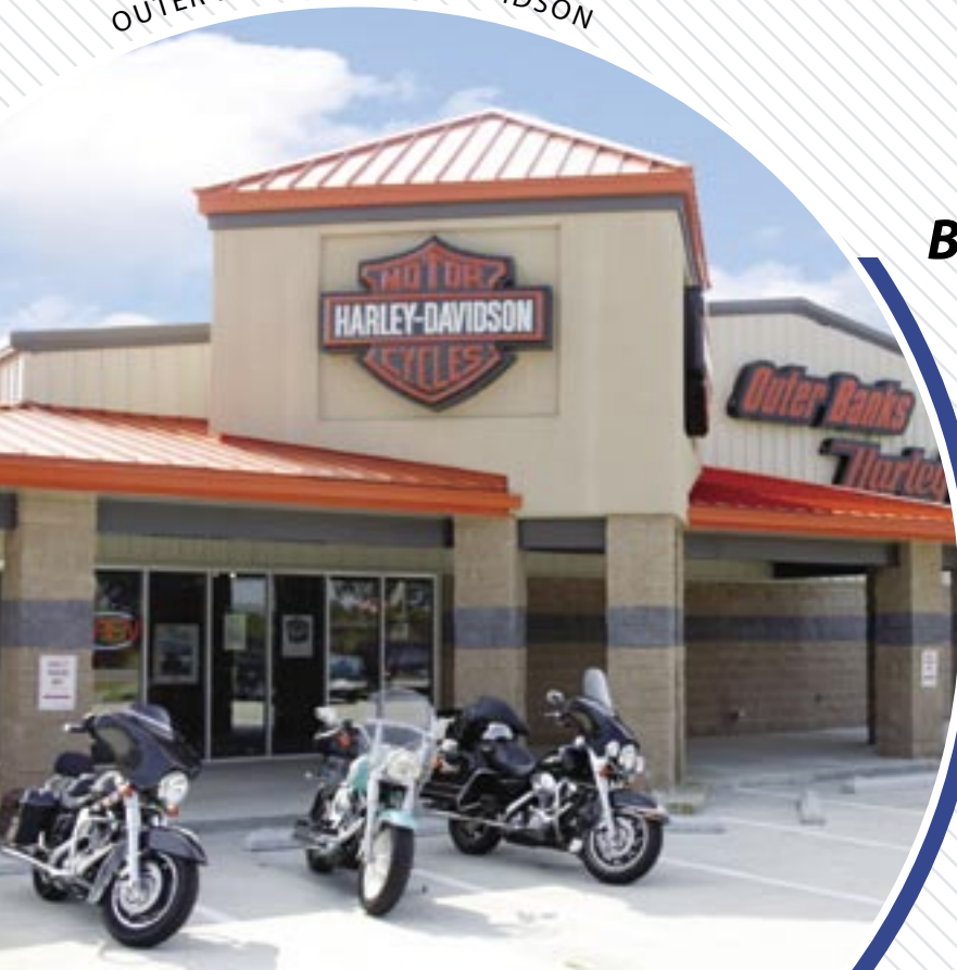
OUTER BANKS HARLEY DAVIDSON