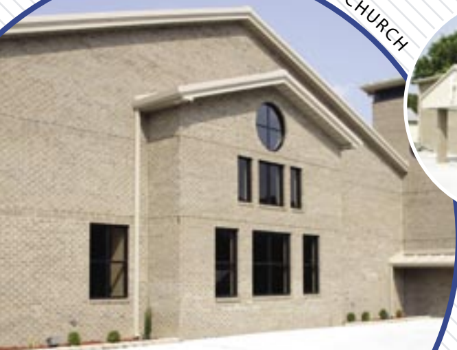
FIRST PENTACOSTAL HOLINESS CHURCH

Culligan Elizabeth City, NC Chesson Design/Build August 2002